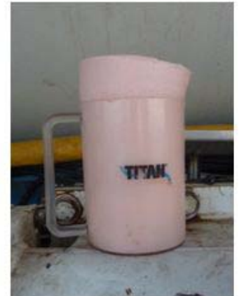
TITAN ® Bulk Emulsion